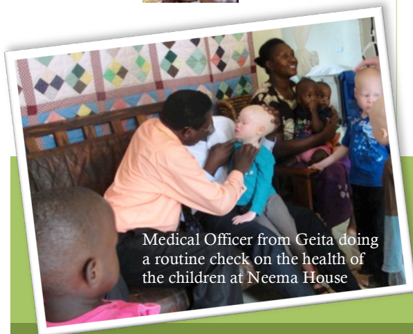
Medical Officer from Geita doing a routine check on the health of the children at Neema House